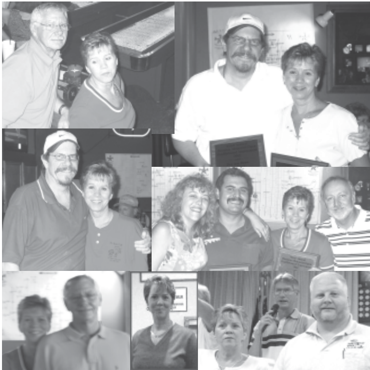
Table Shuffleboard Association